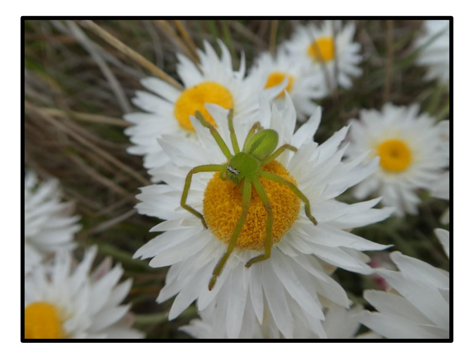
Neosparassus diana, badge huntsman spider

Thank you to all who attended this evening and also for the wonderful sweet and savoury items provided for supper.