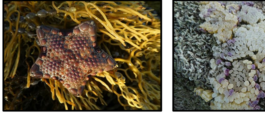
Tosia australis, southern biscuit star

Disappointed with the variety of species seen, we ventured further around the headland where we spent an hour looking around, seeing a variety of marine grasses and starfish, crabs including a decorator crab found by Helen, anemones and tulip shell egg cases. Karen Manning